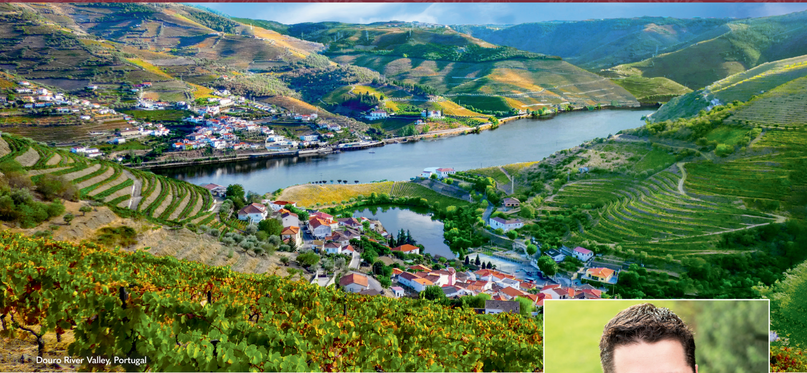
Douro River Valley, Portugal

UNCORK LOCAL TRADITIONS, SAVOR INTENSE FLAVORS AND ENJOY PALATE-PLEASING ADVENTURES DURING AN AMAWATERWAYS WINE CRUISE